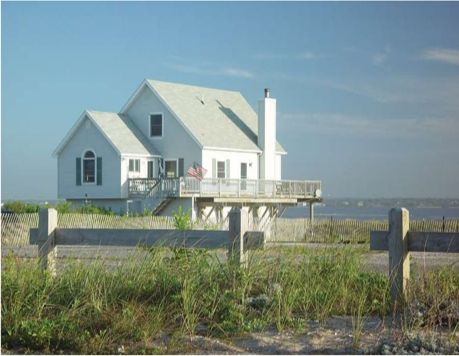
The Hamptons offer a perfect getaway surrounded by water.