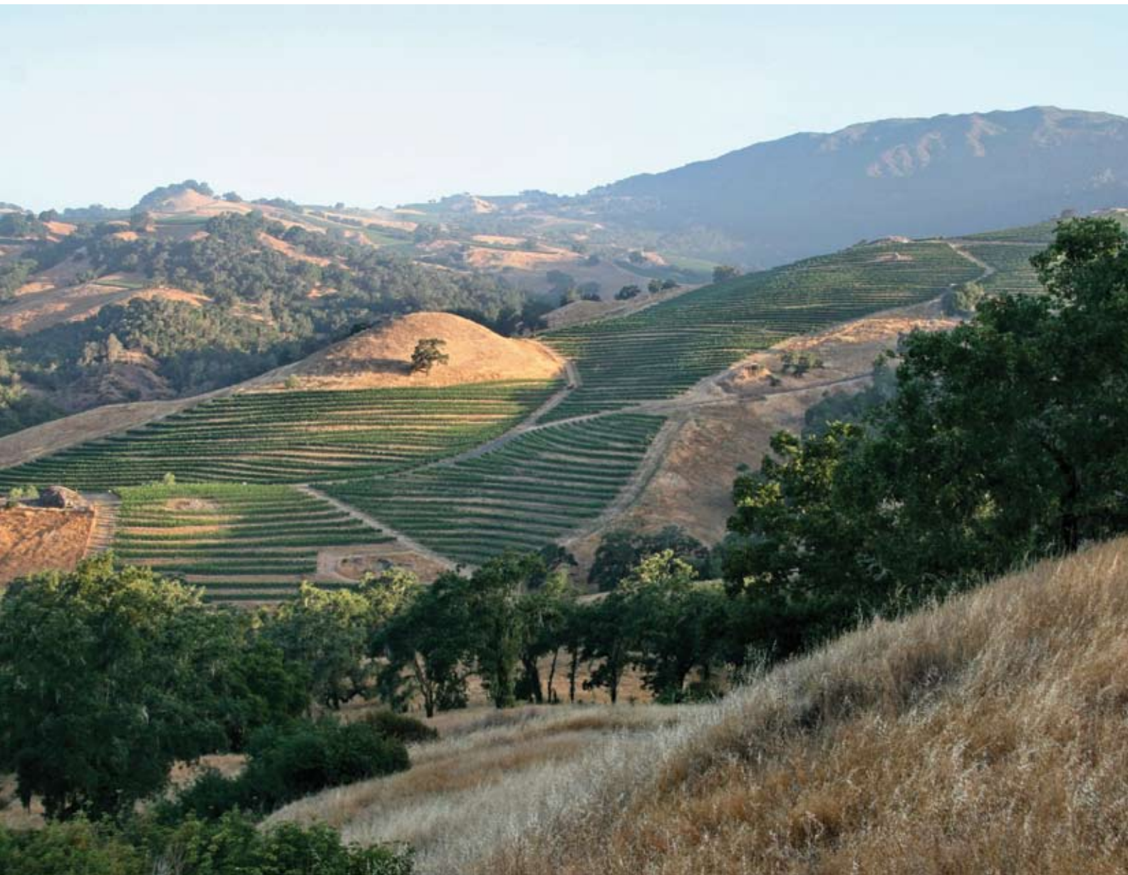
Vineyards nestled in valleys create breathtaking views in Sonoma County.