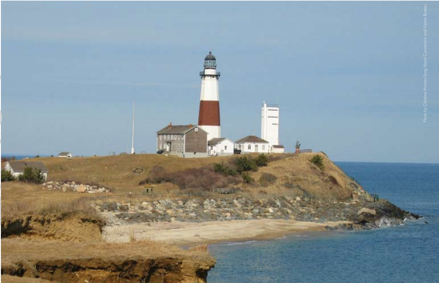
The Montauk Lighthouse is over 200 years old making it the oldest lighthouse in New York state.

For years, the Hamptons have been America's summer playground for the rich and famous. The chance to hobnob with celebrities such as Stephen Spielberg, Jerry Seinfeld and Sarah Jessica Parker is only part of the draw. Located on the east end of Long Island, New York, in Suffolk County, this group of towns and seaside villages