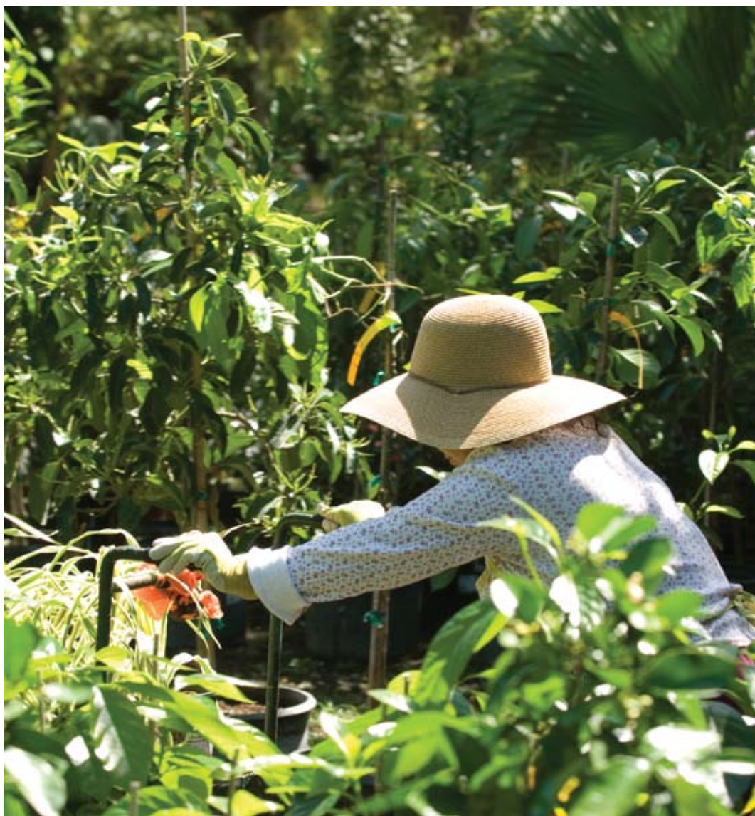
A wide selection of lush foliage can be found at Maas Nursery.

An alternative to an afternoon of outdoor activity is a stroll through Old Seabrook. With its quaint, town-center feel, Old Seabrook is lined with antique shops, boutiques and specialty retail businesses offering unique and treasured wares.