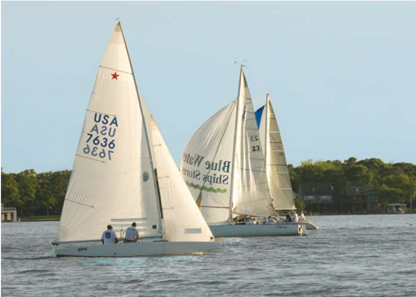
Sailboats off the shores of Seabrook navigate Clear Lake and Galveston Bay.