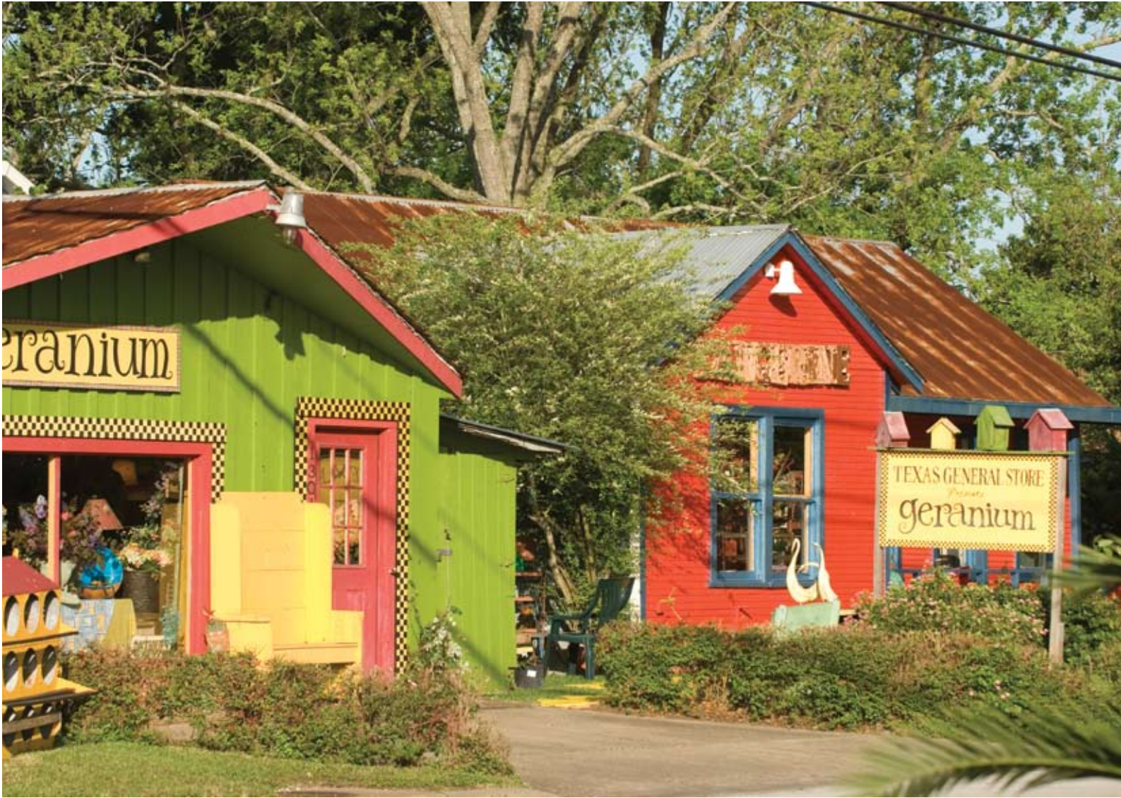
Brightly colored shops in Old Seabrook offer a unique shopping experience.

Seabrook is an appealing summer getaway. With ecotourism, water recreation, a family environment, and quaint shops and restaurants, this is a city that is full of possibilities. And, the interesting part—it is one of Texas' best-kept secrets.